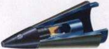
OGIVE WITH SELF REGISTRATION ASSEMBLY