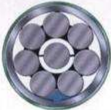
CROSS SECTION OF PAYLOAD