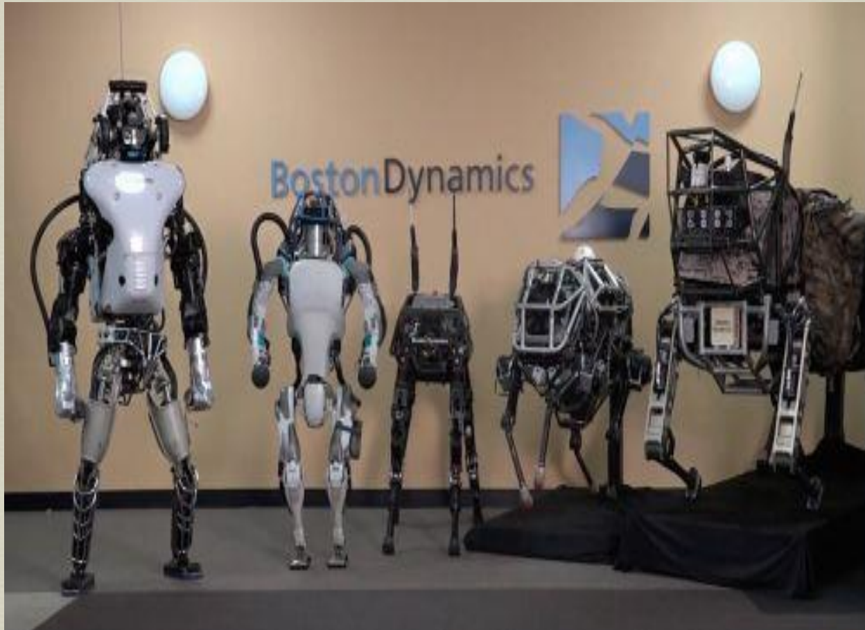
Fig. 4. Atlas Robot. "The Next Generation of Boston Dynamics' ATLAS Robot." Futuristic News , February 2016.