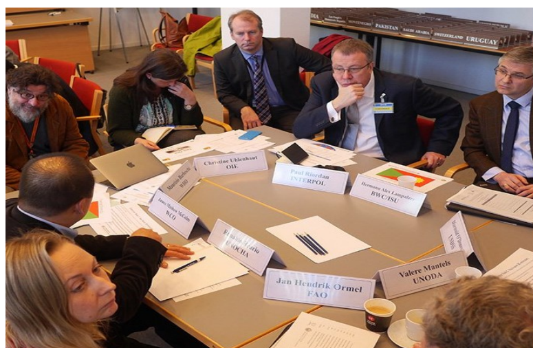
Participants of the CTITF Table Top Exercise

ISU staff attended a two day table top exercise of the UN CTITF Working Group on Preventing and Responding to WMD Attacks . The Task Force is mandated to strengthen the exchange of information and knowledge among relevant UN entities and international organizations related to response to WMD terrorist attacks. The CTITF derives its mandate from the UN Global Counter-Terrorism Strategy, under General Assembly resolution 60/288 in 2006. 30 representatives, including experts from 16 international organizations participated in the table top exercise, hosted by the OPCW and funded by Canada.