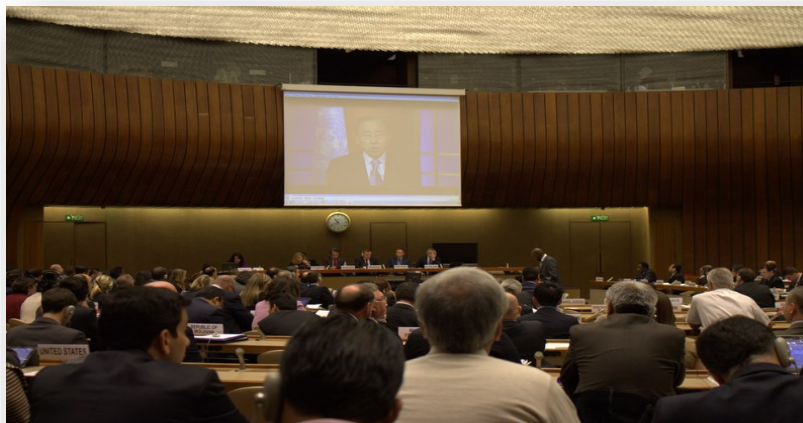
Video message of the then UN Secretary-General Ban Ki-moon to the Eighth BWC Review Conference

The Eighth Review Conference decided that the next Meeting of States Parties will take place in Geneva from 4 December 2017. The meeting will “seek to make progress on issues of substance and process for the period before the next Review Conference, with a view to reaching consensus on an intersessional process.”